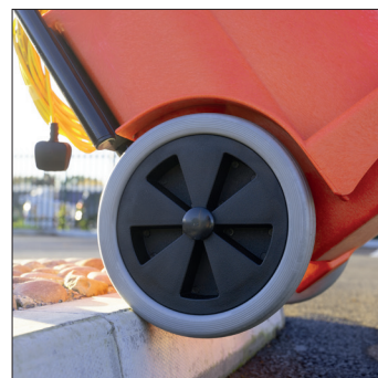
Large Rear Wheels for Excellent Mobility