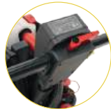
Simple soft-touch controls