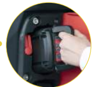
Easy battery change