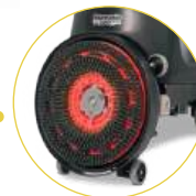
Simple pad/brush change