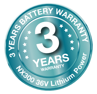
NX300 Battery 3 Year Warranty.

UK EURO 915748 915749 915750 SWISS AUS/NZ 915751 USA 915752 S.AFRICA 915753 JPN 915754