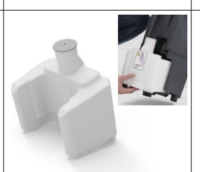
Solution Tank PN: 913825

For maximum cleaning contact with the floor and an inner harder shore core leaving a dry streak-free floor. Supplied as pack of 2. PN: 913810