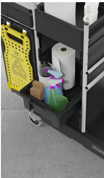
Open shelf storage options for easy access to all your cleaning equipment and supplies on the move.