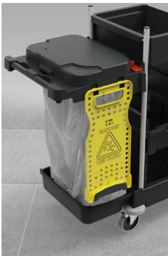
Integrated wet floor sign storage for easy access and unobtrusive whilst stored.